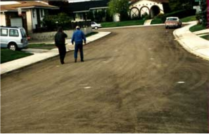
Residential Street - City of Edmonton - Alberta 200mm asphalt milled with 175mm heavy clay. CON-AID/CBR PLUS stabilized the full layer. 80mm Asphalt layer was placed onto the treated layer.