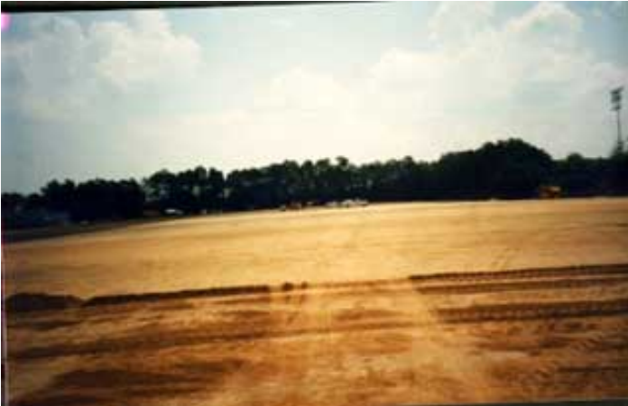
Tera Parking Lot - Atlanta Georgia USA 100 mm Gravel milled with 100 mm clay base CON-AID/CBR PLUS stabilized the full layer. 80 mm Asphalt layer was placed directly onto treated layer