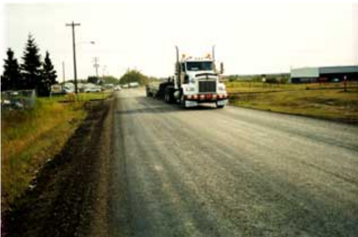
Street in Nisku Industrial Area - Leduc Alberta 80mm asphalt milled with 250mm heavy clay CON-AID/CBR PLUS stabilized layer. The picture shows the unsealed surface of the treated road after twelve months.